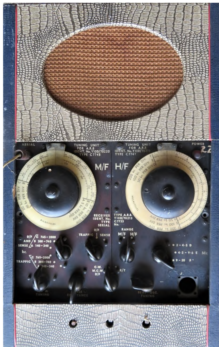
AR8 Aircraft Receiver Modified