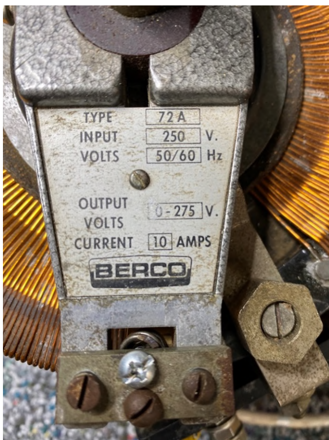
Above: The "modified" brush holder