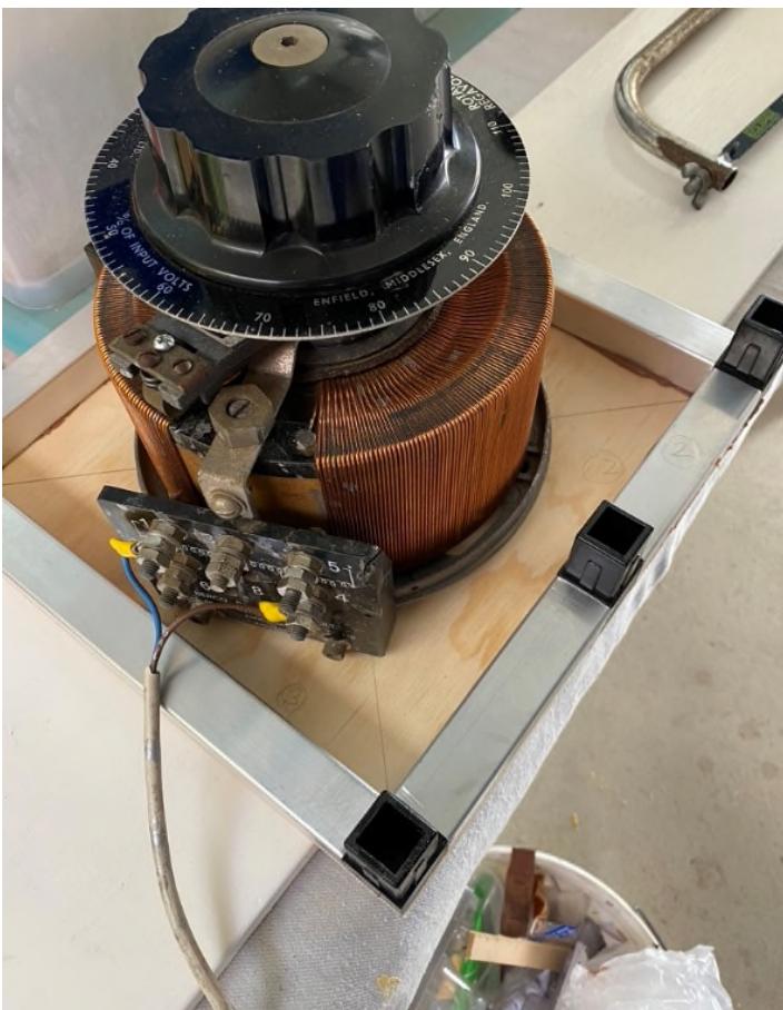
Above: Baseboard and “Cube Lock” frame