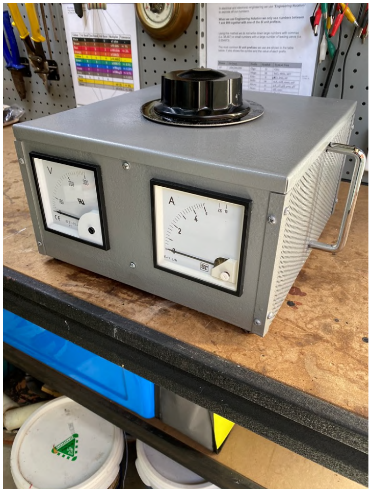
Above Left:: The new large-display Voltmeter in place