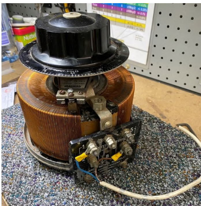
Right: No casing and spashed with old