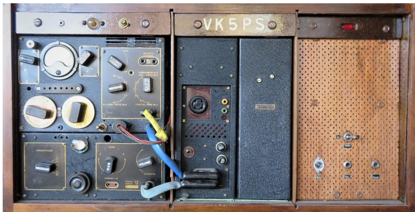
Modified Clandestine Type 3 Mark 2 Transmitter-Receiver