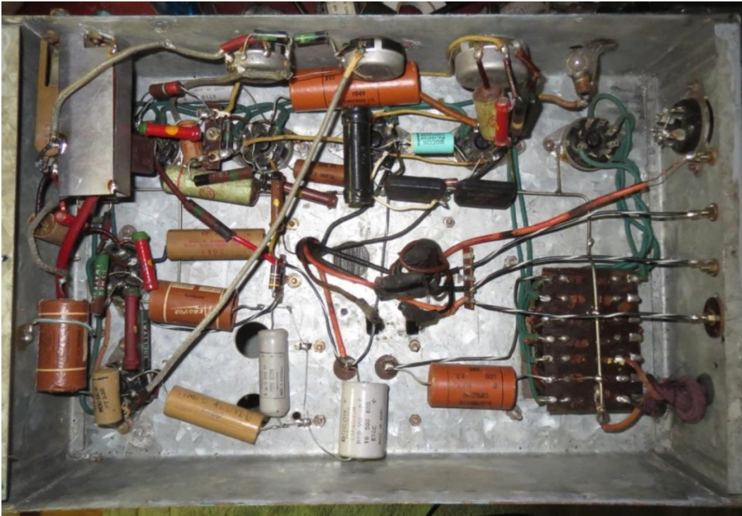
ABOVE: The Nomis before re-capping.