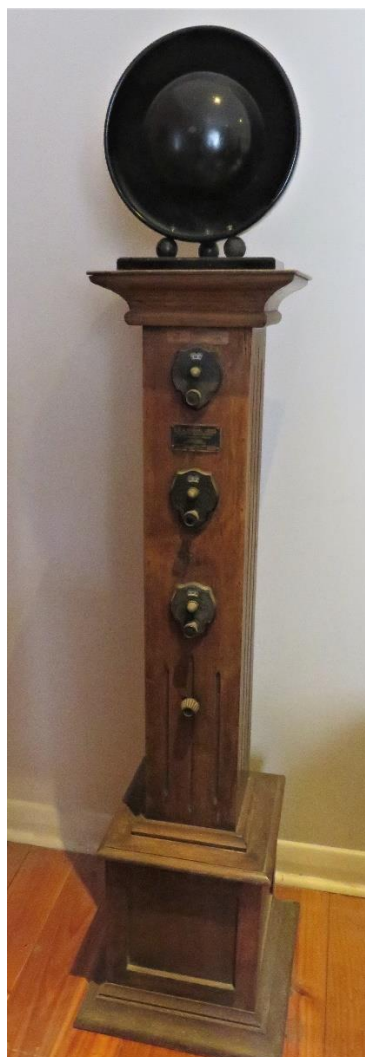
THE “HEMAC” PURETONE PEDESTAL WIRELESS SET