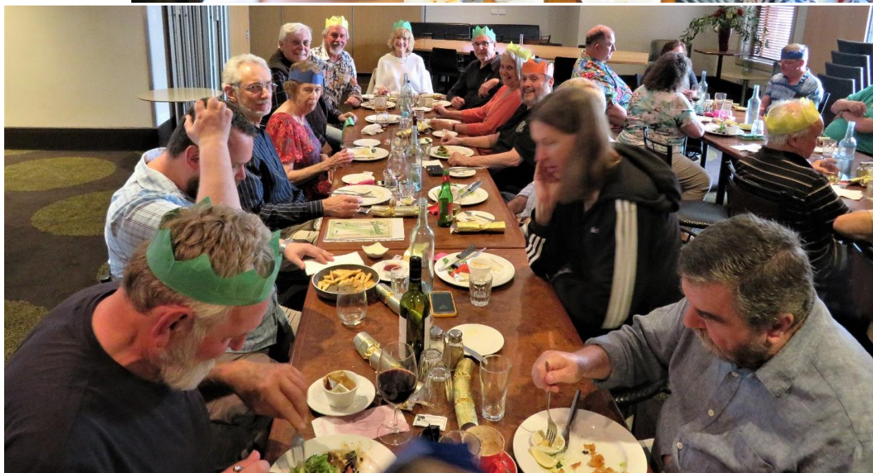
TOP: Retirees luncheon at the Reepham Hotel in November