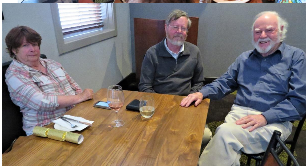
TOP: Window table looking north.