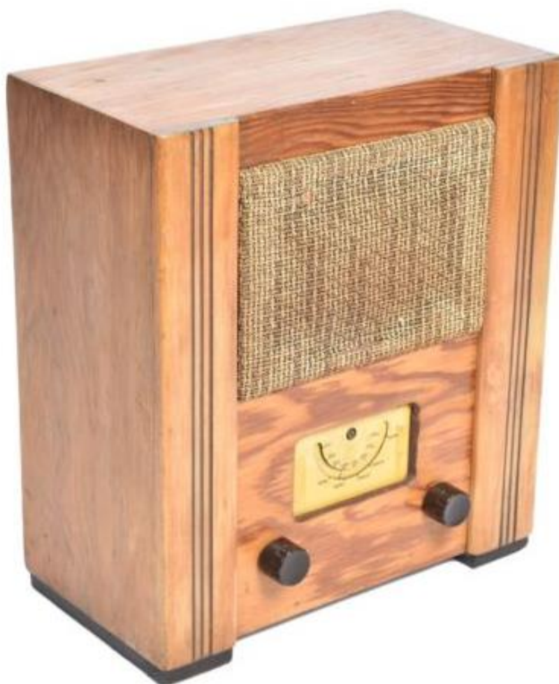
BRITISH WARTIME CIVILIAN RECEIVER