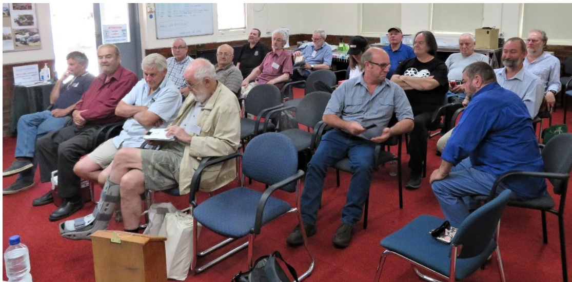
Left: The crowd at the National Military Vehicle Museum for the January meeting.