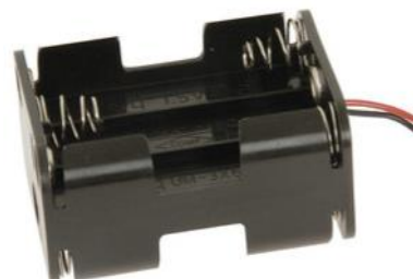
6 x AA by 3 side by side battery older Cat. No. PH9206

If you do not have the original connector block any more, just solder the free Red wire to the Speaker +ve terminal, and the free Black wire to the Power switch on the volume pot.