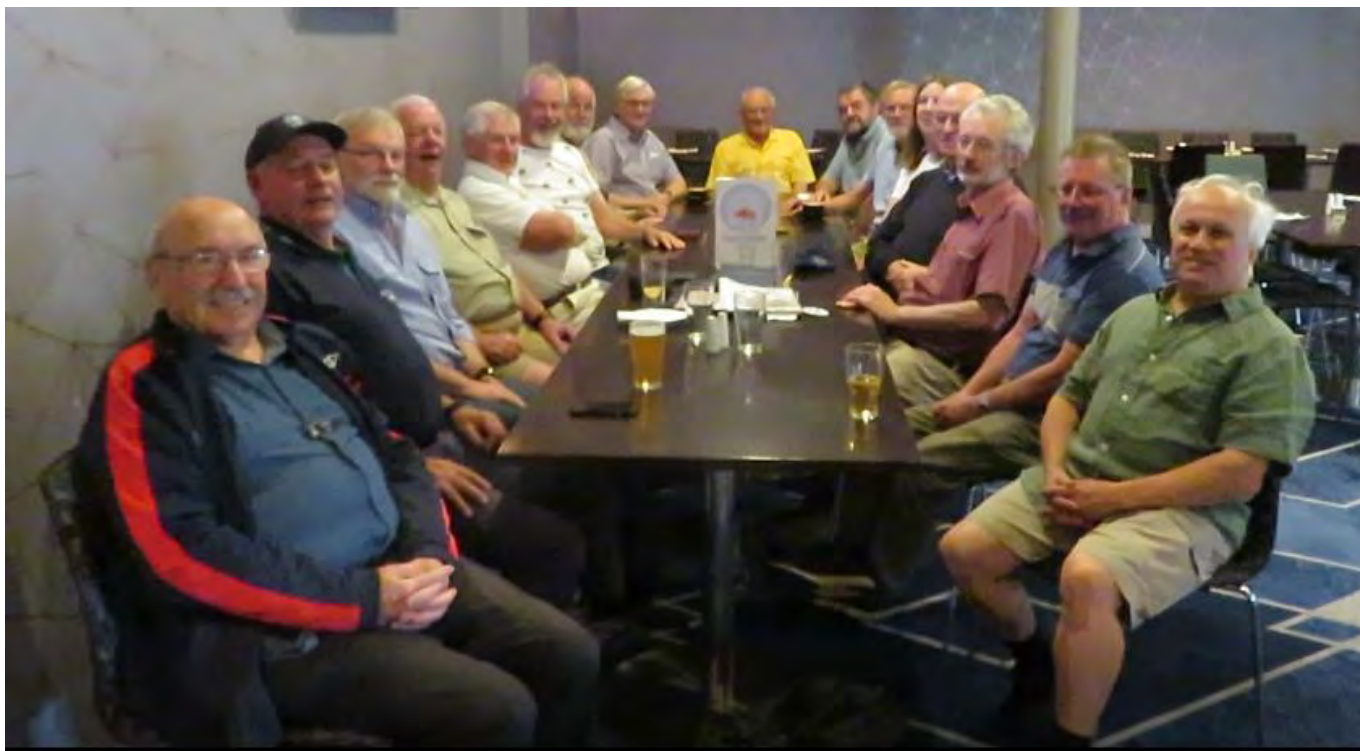
Above: The 16 at the last ‘Retirees’ Luncheon’ at the Earl of Leicester last March