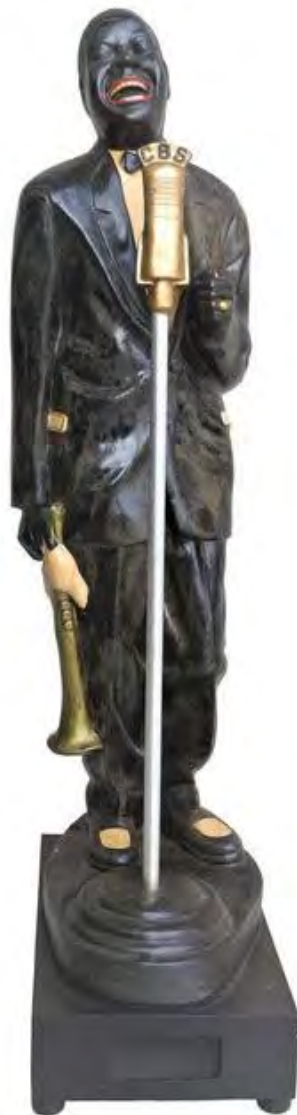
S.A. GROUP MASCOT