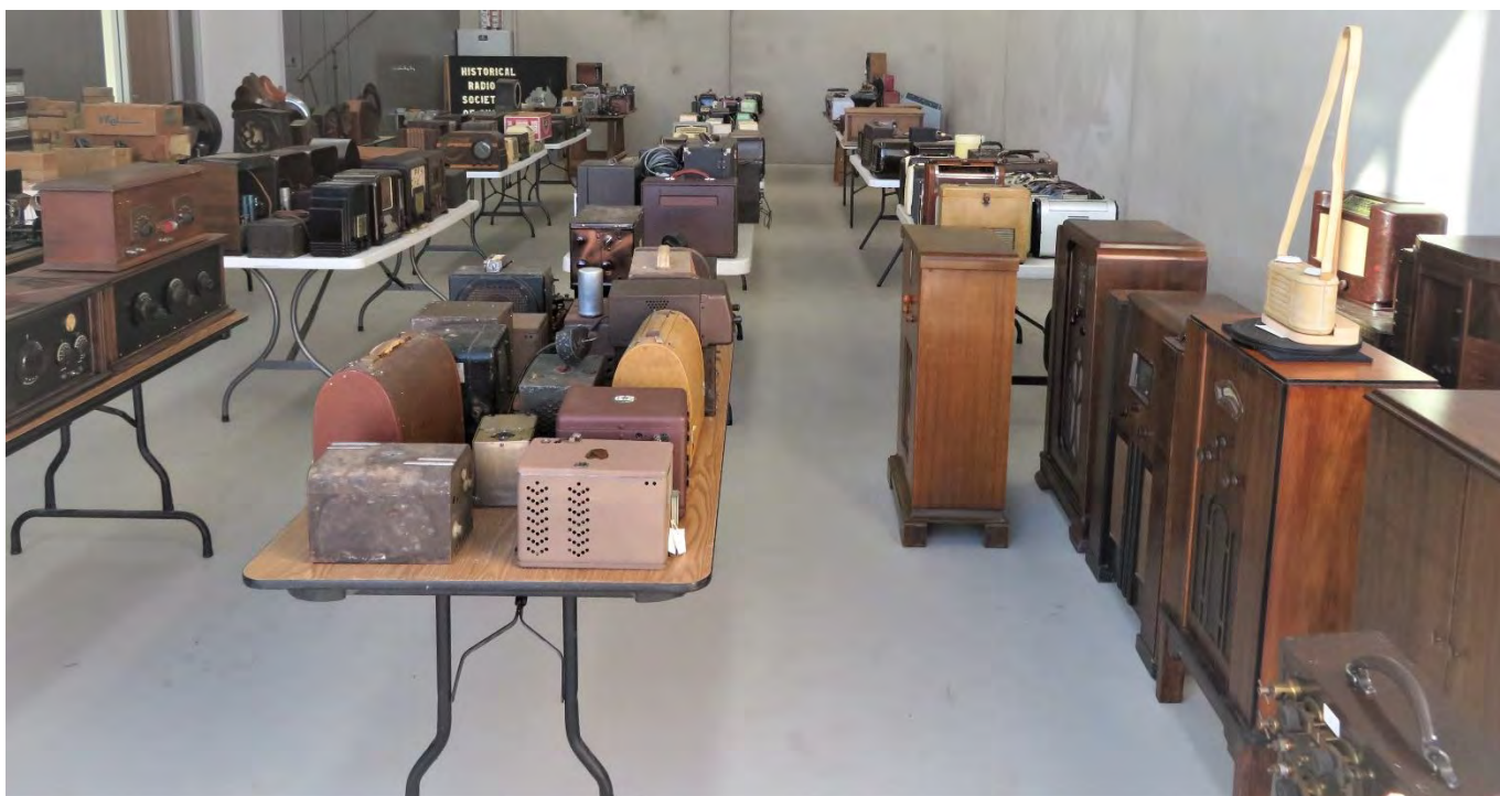
Above: Most of the radios coming up for sale in May.