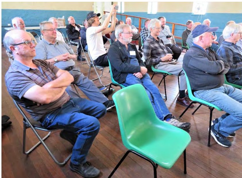
Left and Below: The crowd of members at the March meeting in St Cyprian's Church hall.