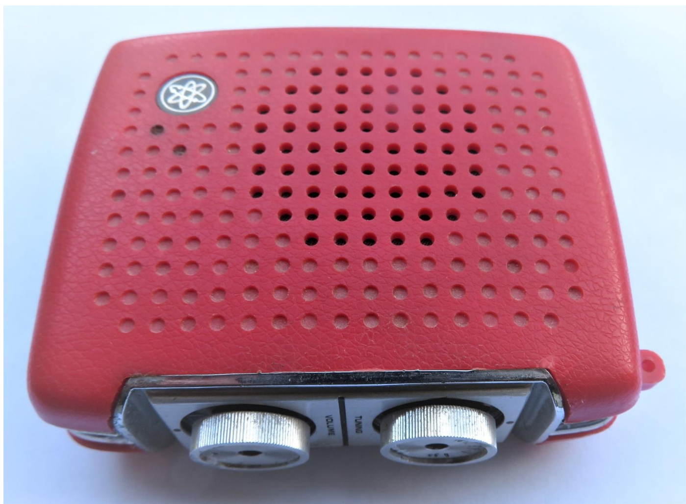
Expo 70 Transistor Radio