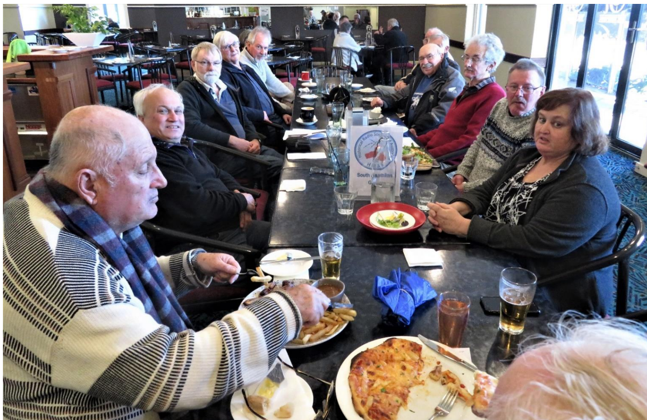
Above: The Retirees Luncheon group at the July luncheon, looking south