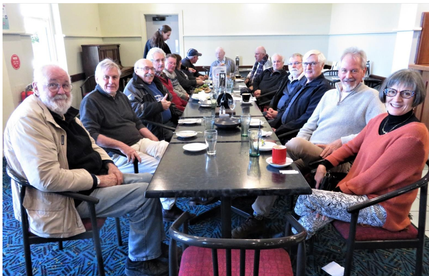
Above: The Retirees Luncheon group at the July luncheon. looking north